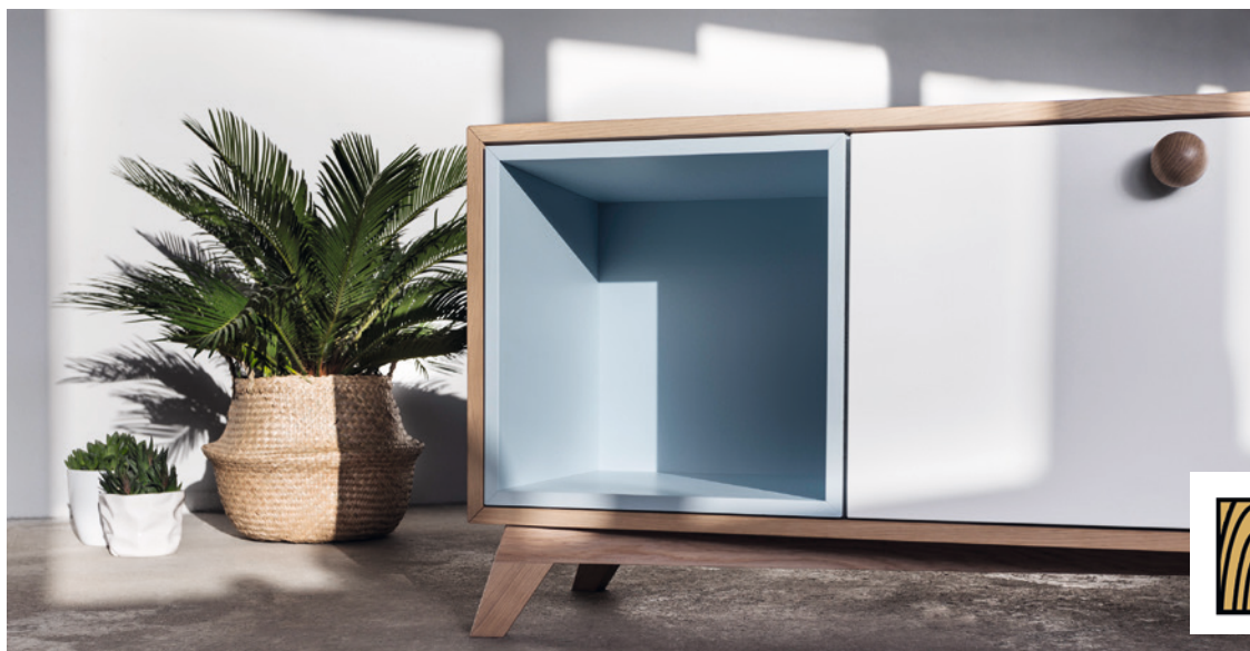
The RTV cabinet from the brand Talukko